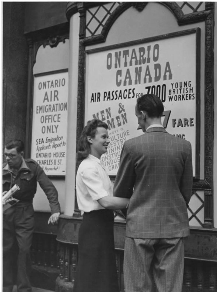
Potential emigrants viewing poster for the Ontario Air Immigration Plan, 1947 RG 9-7-4-1-1

Ontario Air Immigration Plan photographs