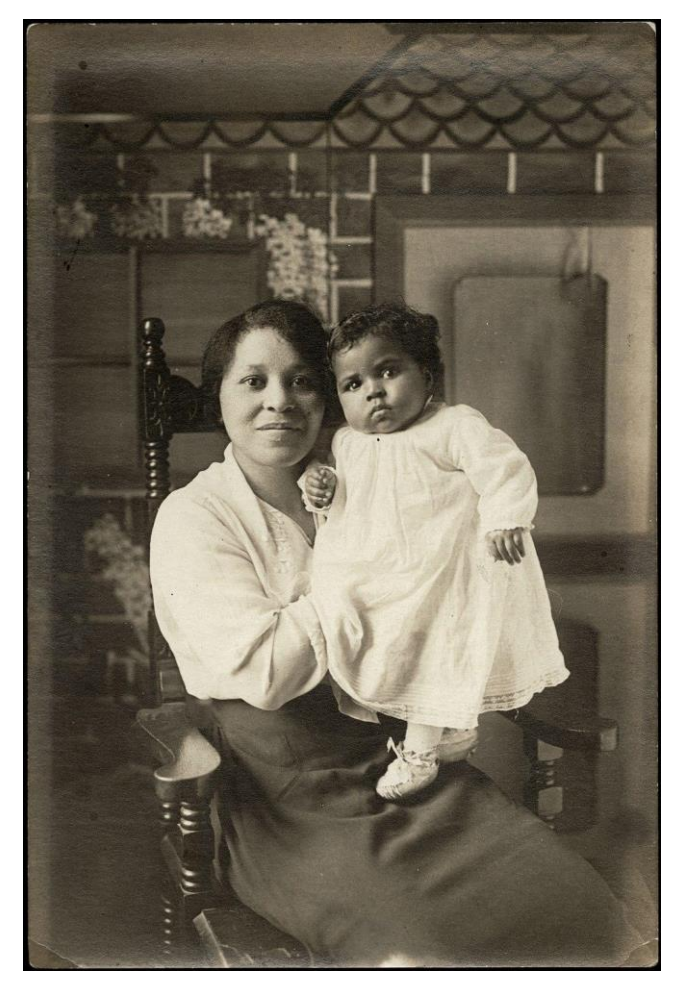
Woman holding a child, [between 1900 and 1920], I0024828, F 2076 Alvin D. McCurdy fonds