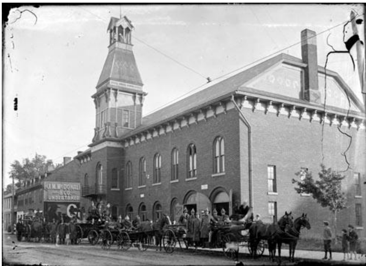
Fire brigade on street outside Cornwall Town Hall