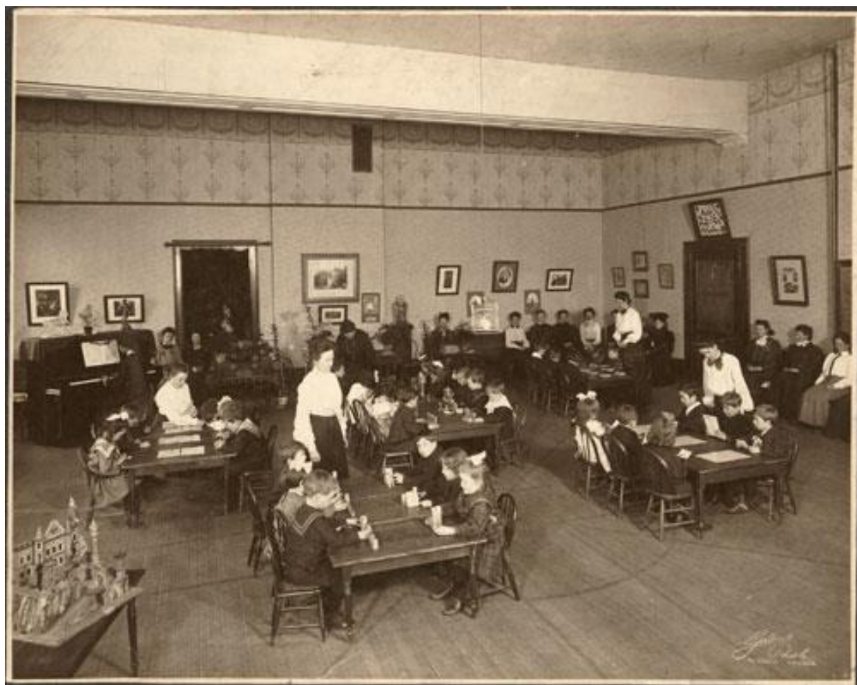
Student teachers practice teaching kindergarten at the Toronto Normal School RG 2-257 Acc. 13522 Ontario teachers' college historical files