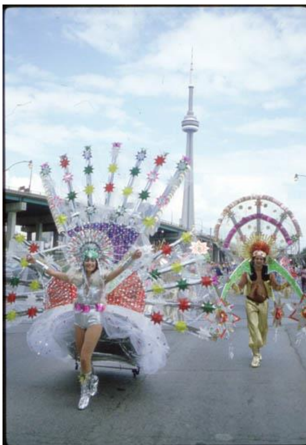
The Caribana Parade, 1970's or 1980's RG 14-151-3-149, I0005829 Ministry of Transportation slide subject files