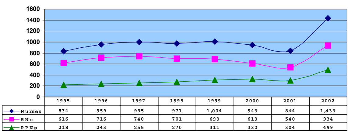
Chart 3. Number of Ontario Nurses Working for Agencies