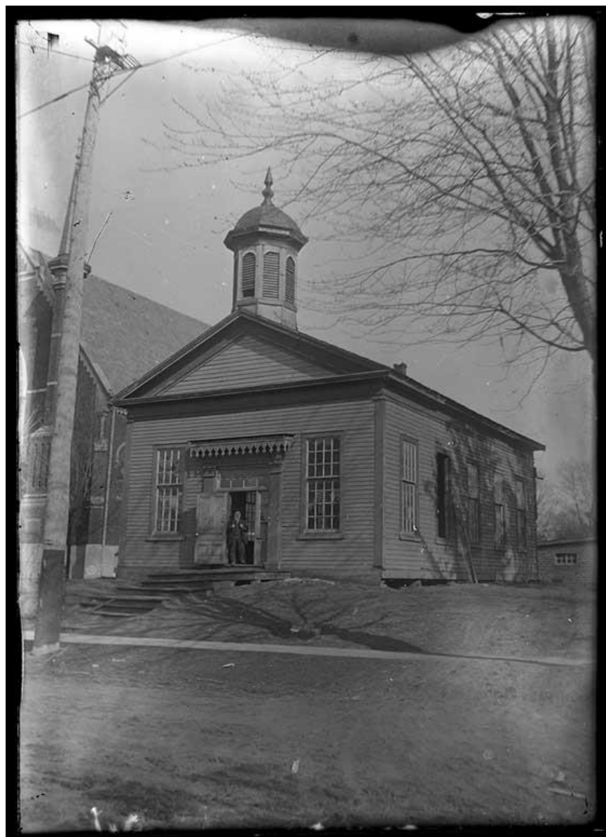
Man standing on front steps of the Howard Township Municipal Hall at 57 Main Street East F 4700-0-0-0-121