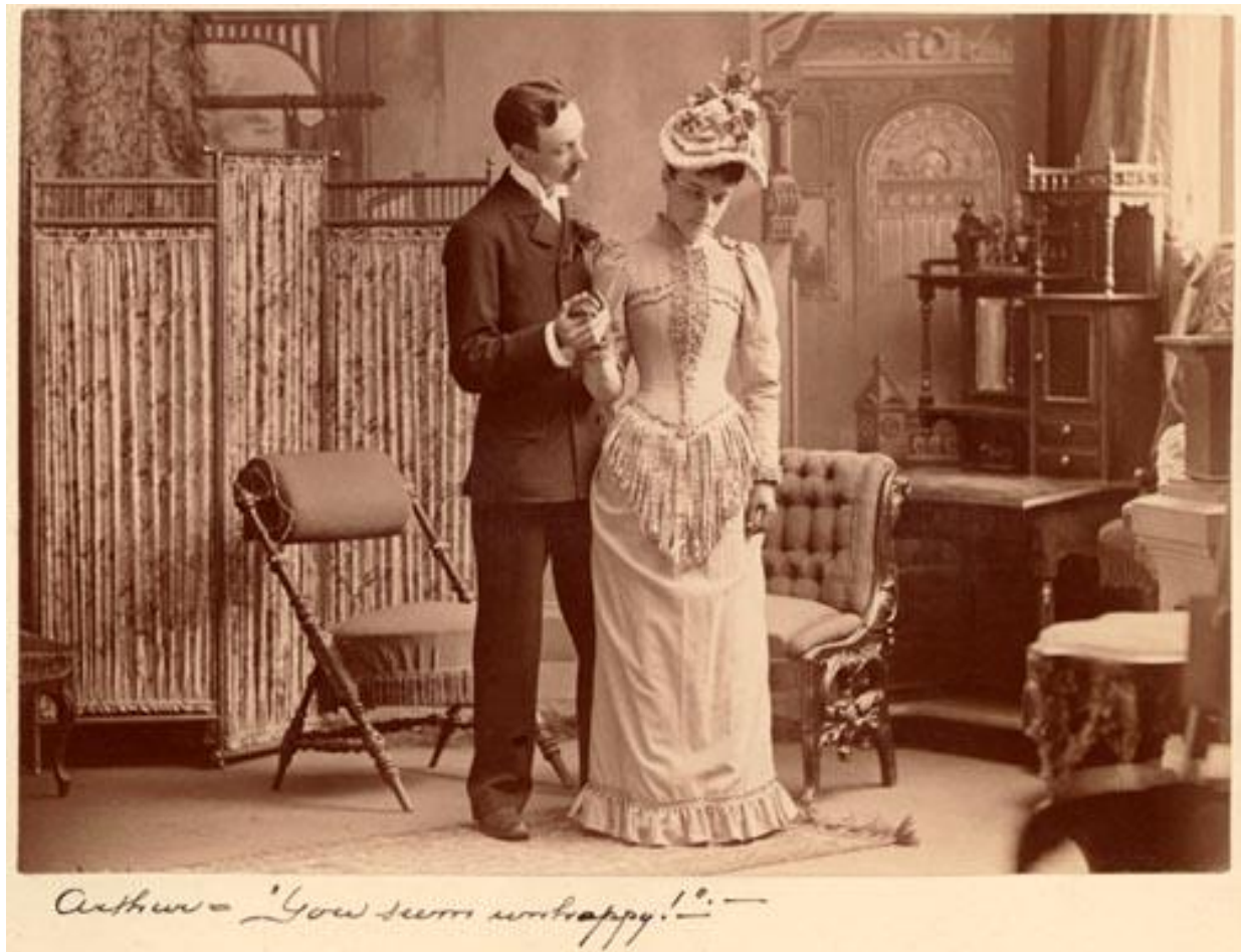
Act II - Arthur: "You seem unhappy!"; Distrust, [ca. 1892]