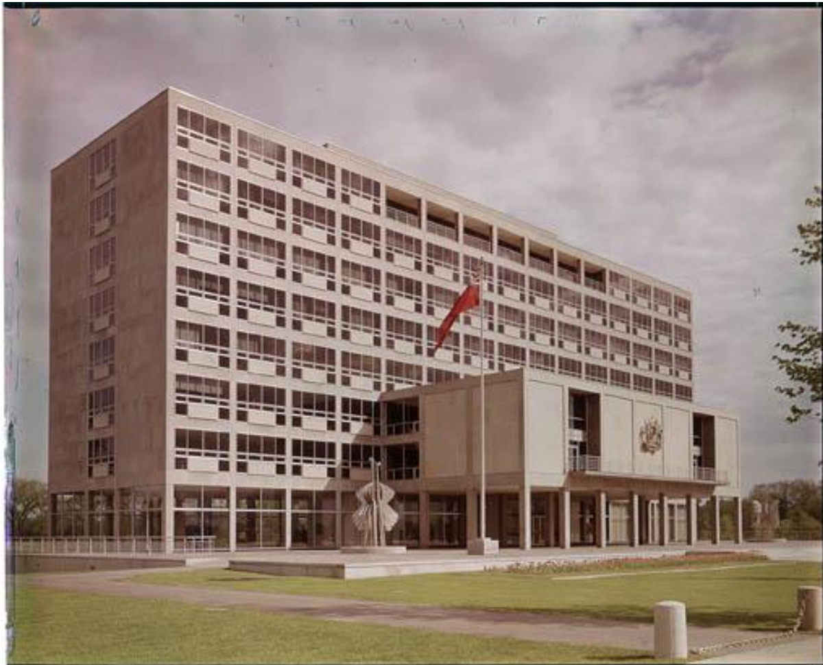
New City Hall, Ottawa, 1959 RG 65-35-3, 11764-X3520 Tourism promotion photographs