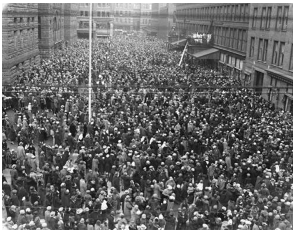
Overhead view of crowd scene, 1926