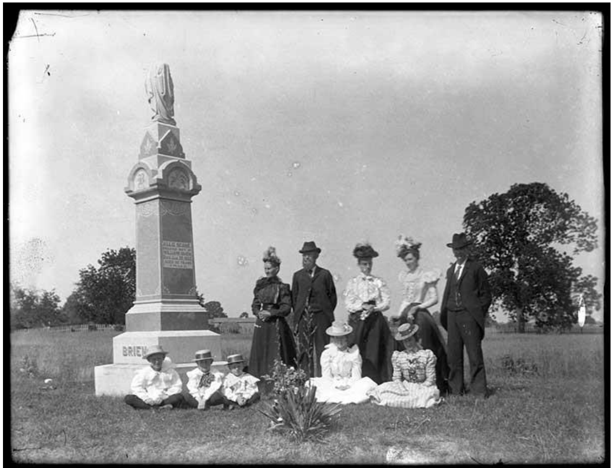
[Men, women, and children standing and sitting next to Brien family tombstone]