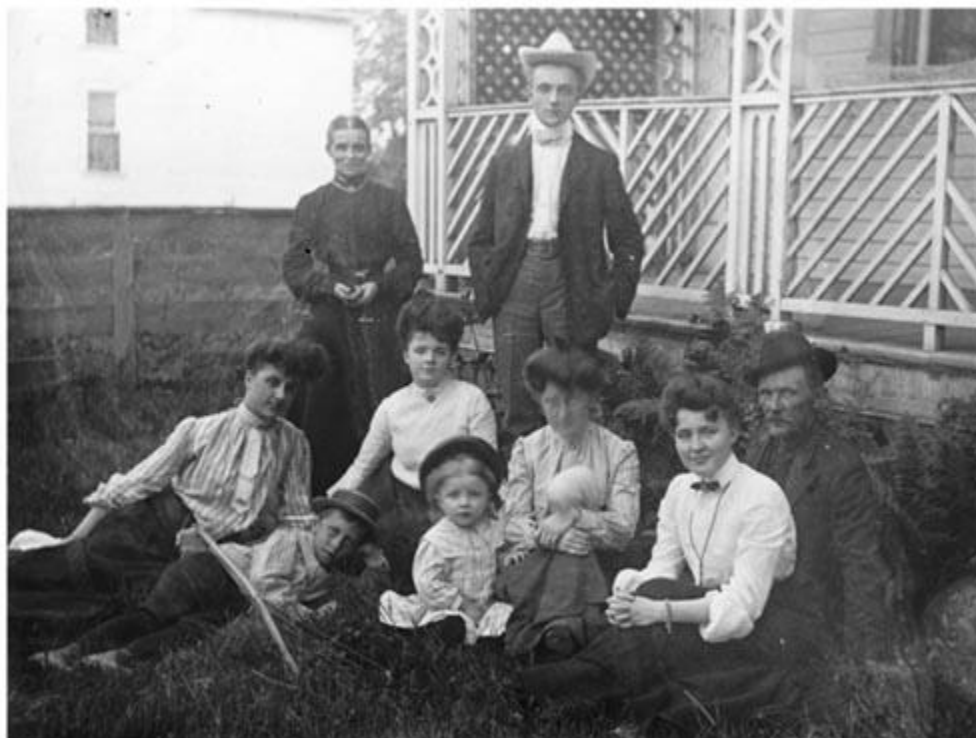
Family group posing in front of house, between 1898 and 1920