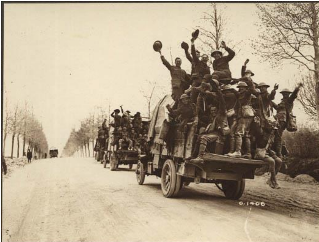
Victorious Canadians celebrating after fighting on Vimy Ridge C 224-0-0-9-41