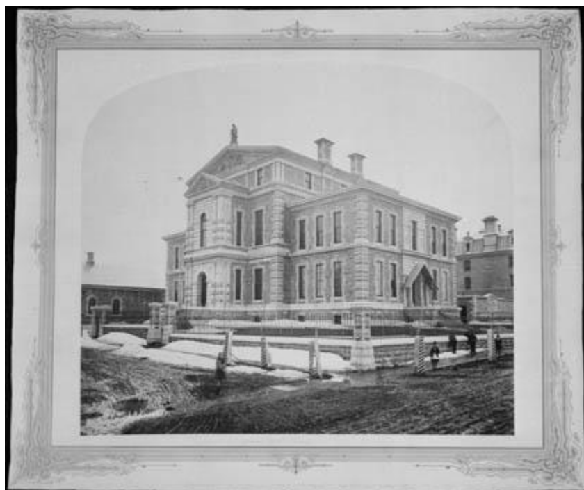
Ottawa Courthouse [ca. 1900] RG 15-90-0-0-59 Public buildings – oversized photographs