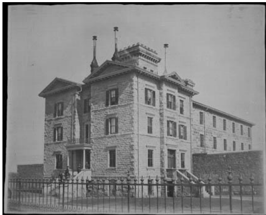
City and County Jail, Hamilton, circa 1890 RG 15-90-0-0-47 Public buildings – oversized photographs