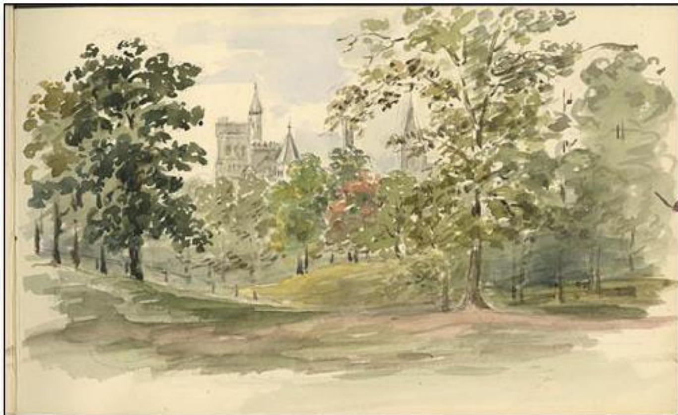
University College , Toronto, [ca. 1879]