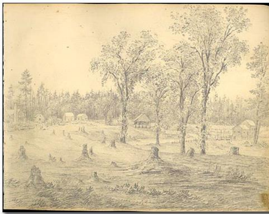
Church at Fenelon Falls, Ontario, 1837

Communities are built by people like. Anne Langton. She did work through her local church, educated young people, and created the first library in the area.