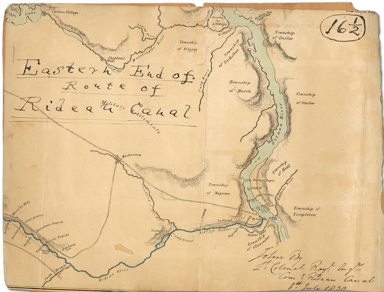
Map of Eastern End of Rideau Canal, 1830

Thomas Burrowes fonds, Reference Code: C 1-0-0-0-115, Archives of Ontario, I0002234