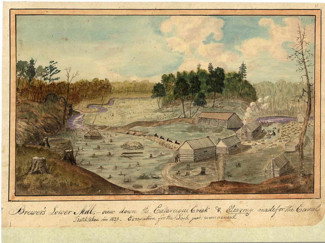
Brewer's Lower Mill; View down the Cataragui Creek, & Clearing made for the Canal. Excavation for the Lock just commenced, by Thomas Burrowes, 1829

Thomas Burrowes fonds, Reference Code: C 1-0-0-0-67