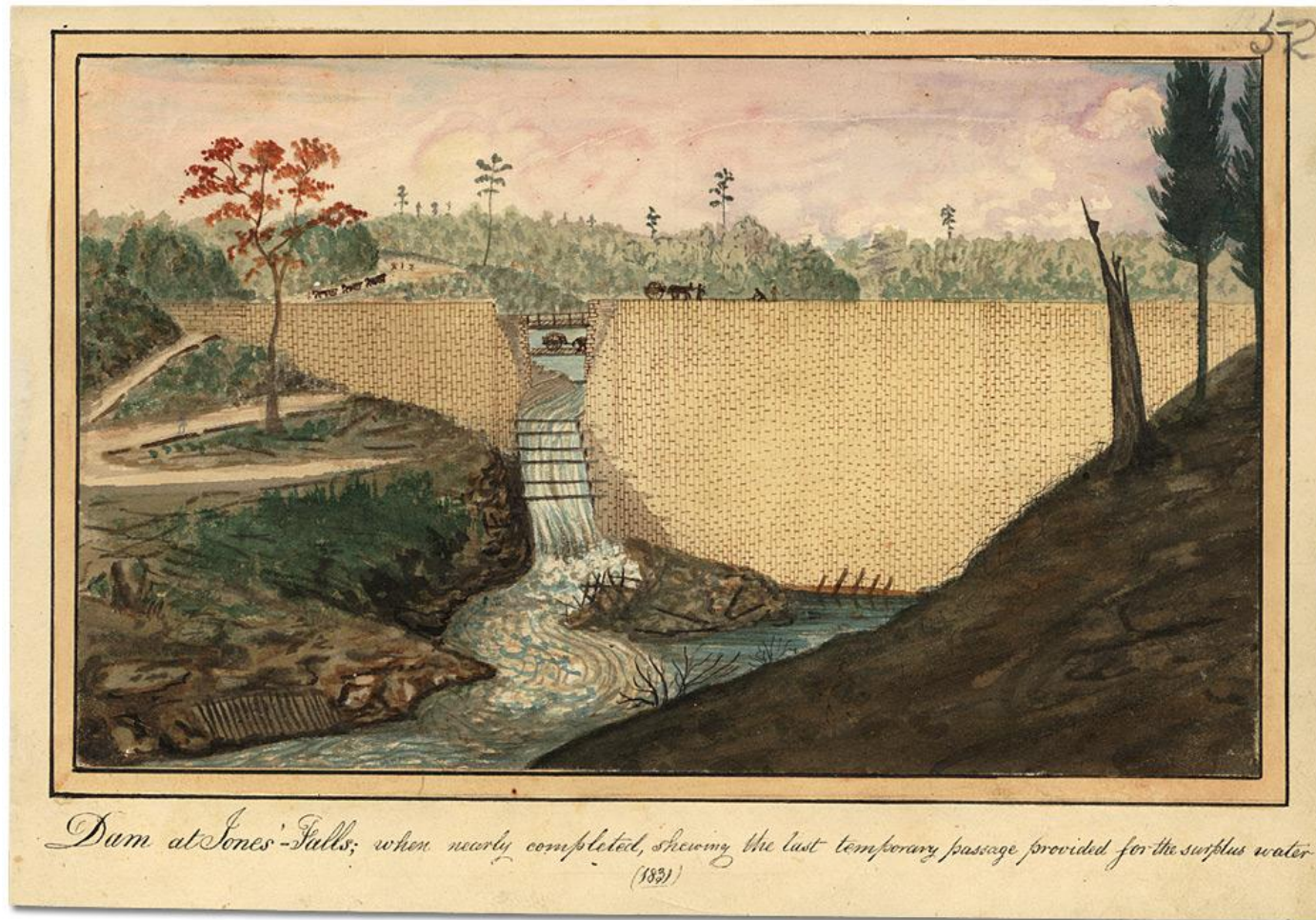
Dam at Jones' Falls; when nearly completed, showing the last temporary passage provided for the surplus water, 1841