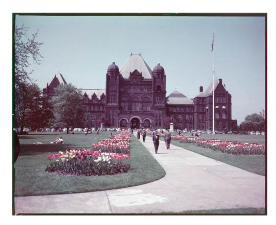
Garden in front of Queen's Park, 1952 RG 65-35-3, 11764-X2401-1 Tourism promotion photographs