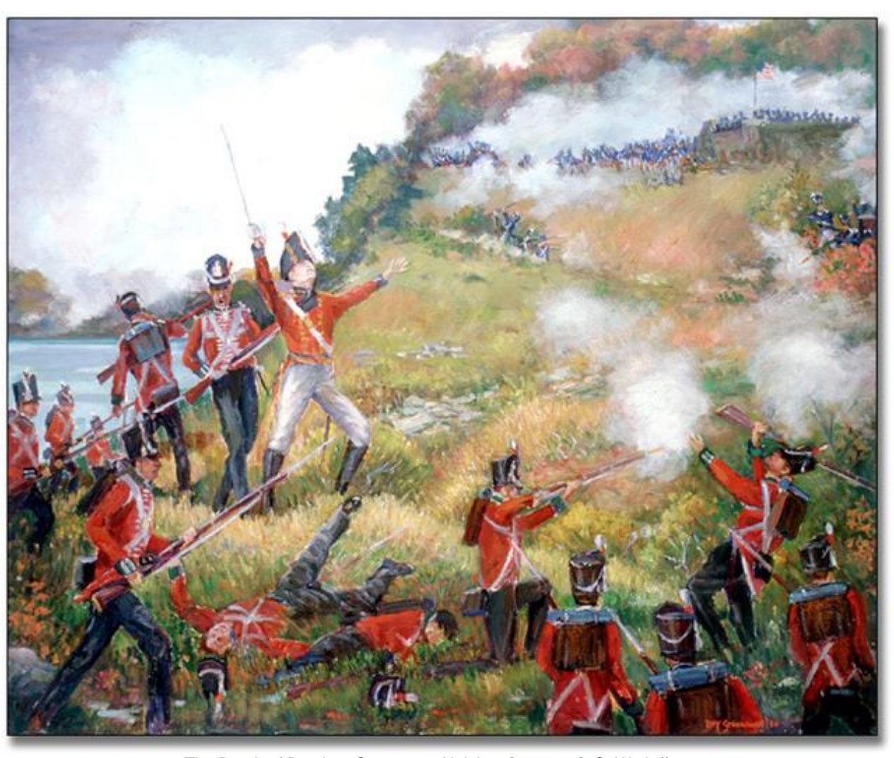
The Death of Brock at Queenston Heights, [ca. 1908], C. W. Jefferys Government of Ontario Art Collection, 619871