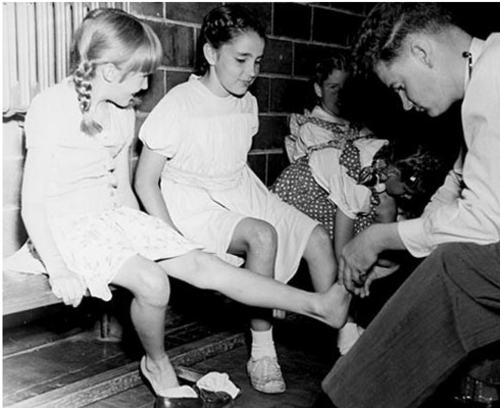
Doctor attending to girls, West Toronto YWCA, [195-?] F 974-6-0-39, I0009476 Young Women's Christian Association of Metropolitan Toronto fonds