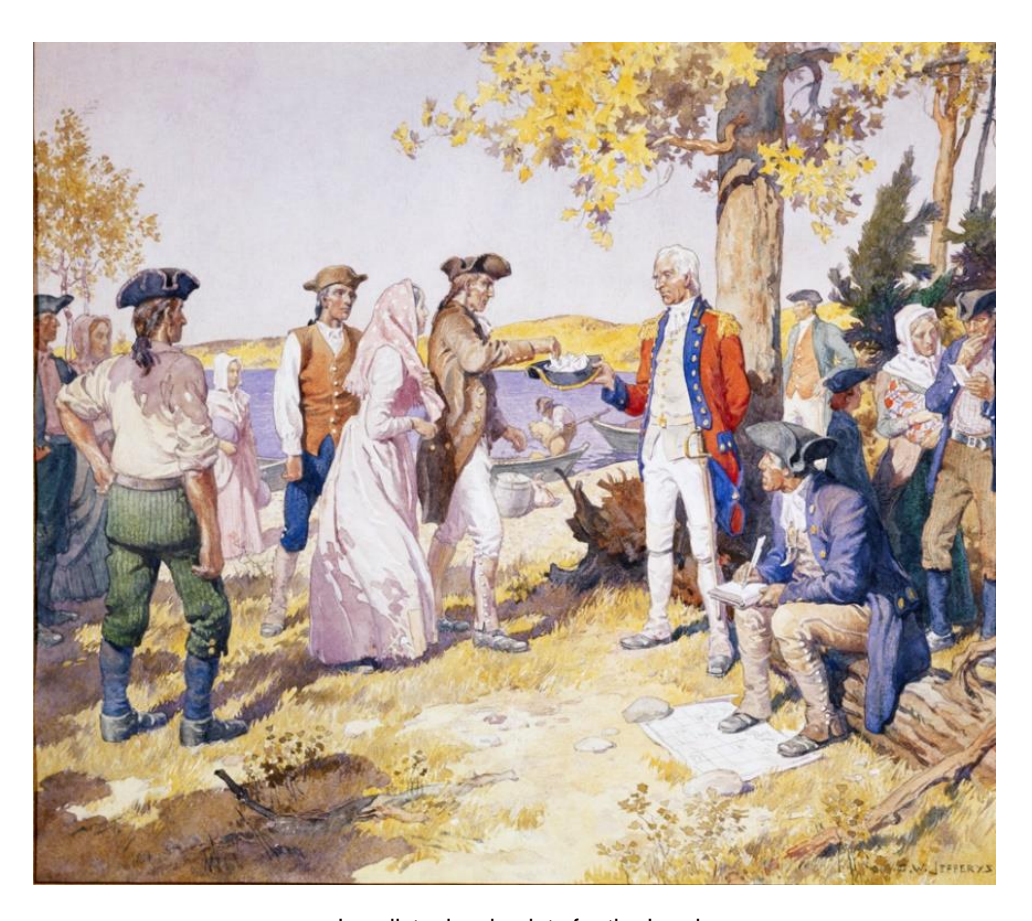
Loyalists drawing lots for the Land Charles William (C.W.) Jeffreys Acc.. 623328 Government of Ontario Art Collection