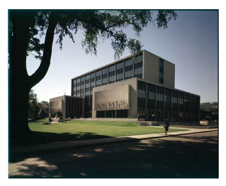
Wentworth County Courthouse RG 65-35-3, 11764-X3552 Tourism promotion photographs