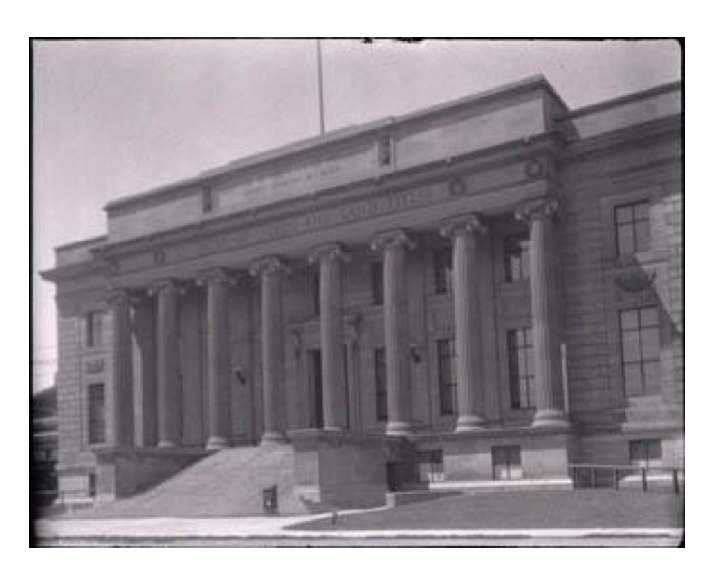
Registry Office, Toronto, 1926 Creator: M.O. Hammond F 1075-13, 10001594