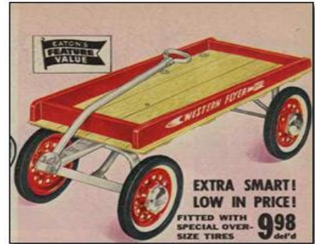
Eaton's Christmas Catalogue, 1956