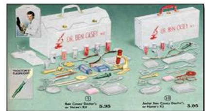
Eaton's Christmas Catalogue, 1962