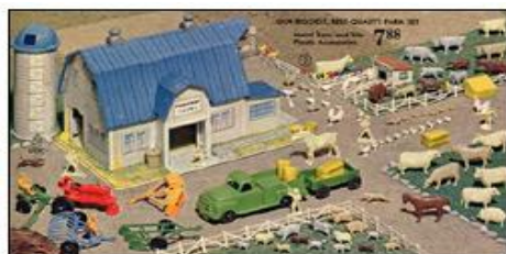
Eaton's Christmas Catalogue, 1962