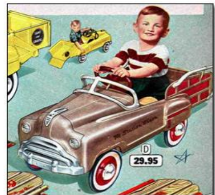
Eaton's Christmas Catalogue, 1956