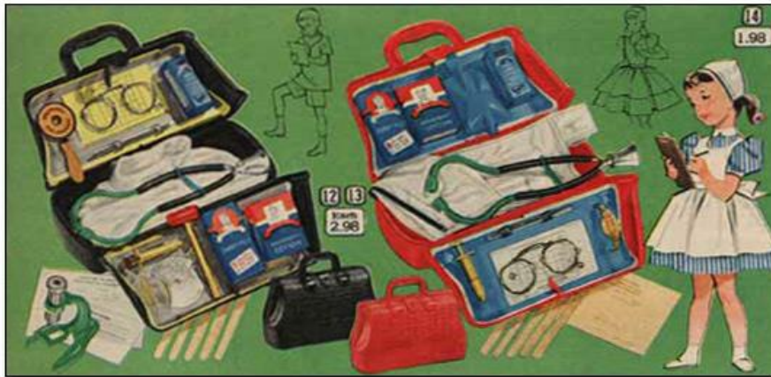
Eaton's Christmas Catalogue, 1956