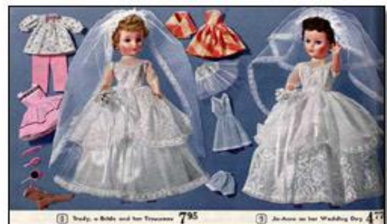
Eaton's Christmas Catalogue, 1962

Acknowledgements The Archives of Ontario thanks Sears Canada for giving permission to use images from the T. Eaton Company fonds held at the Archives of Ontario.