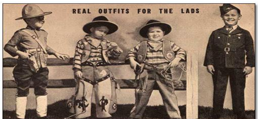
Eaton's Fall and Winter Catalogue, 1940-41

Acknowledgements The Archives of Ontario thanks Sears Canada for giving permission to use images from the T. Eaton Company fonds held at the Archives of Ontario.