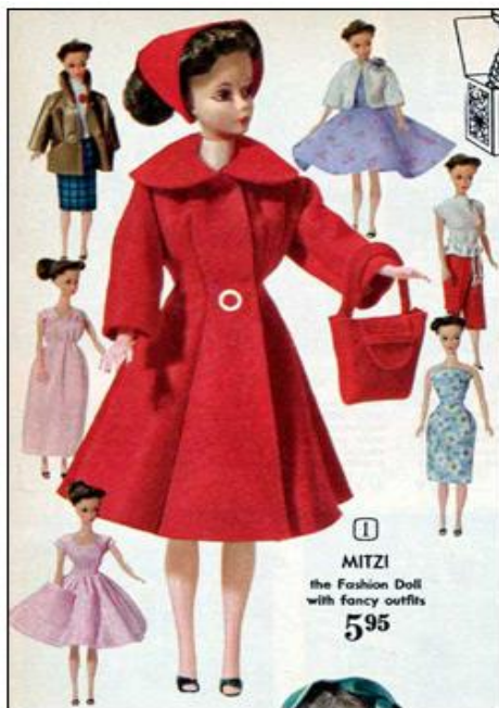
Eaton's Christmas Catalogue, 1962