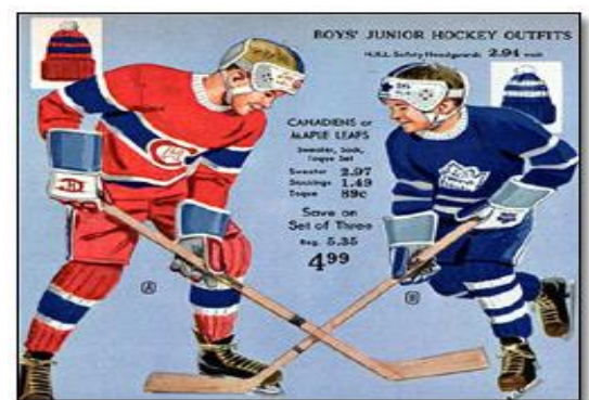
Eaton's Christmas Catalogue, 1962