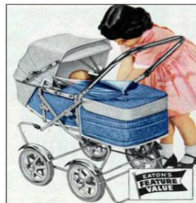
Eaton's Christmas, 1956