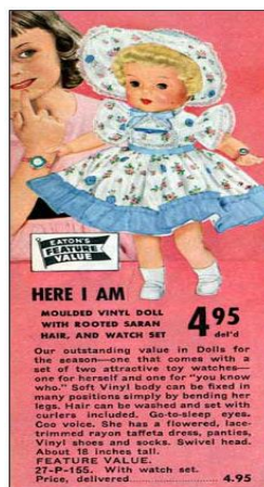
Eaton's Christmas, 1956