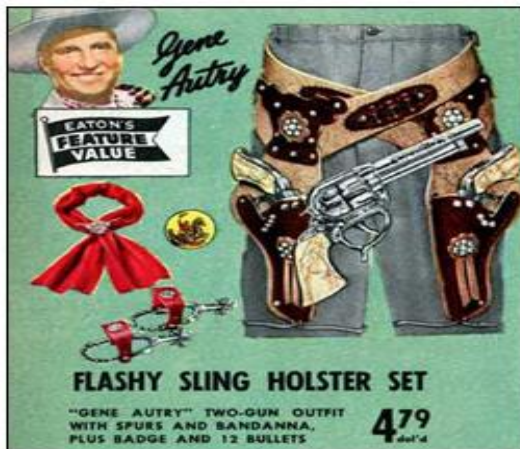
Eaton's Christmas Catalogue, 1956