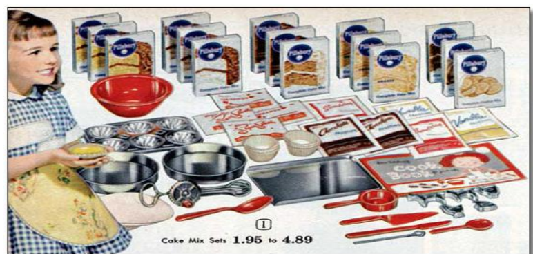
Eaton's Christmas Catalogue, 1962