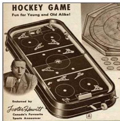
Eaton's Fall and Winter Catalogue, 1940-41