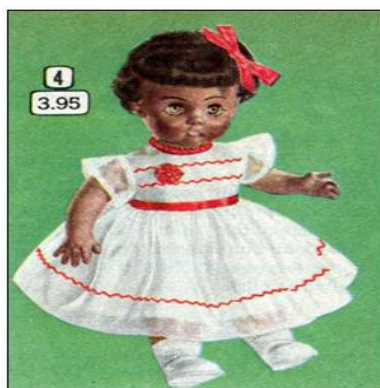
Eaton's Christmas Catalogue, 1956