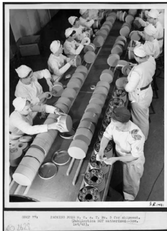
General Engineering Company (Canada) Fonds Canadian Car and Foundry Collection. Reference Code: F 2082-1-2-2.1