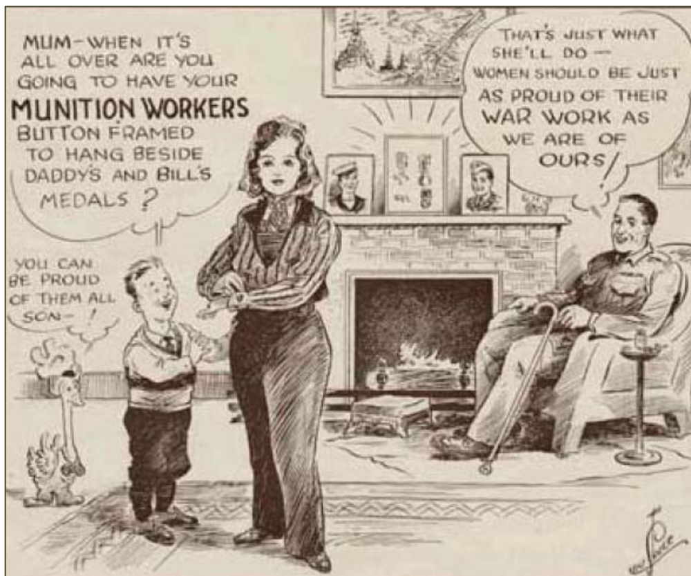
GECO Fusilier: A Powder Magazine Vol. 1 No. 2: April 11, 1942 General Engineering Company (Canada) Fonds Reference Code: F 2082-1-1-22, Box 3 Archives of Ontario