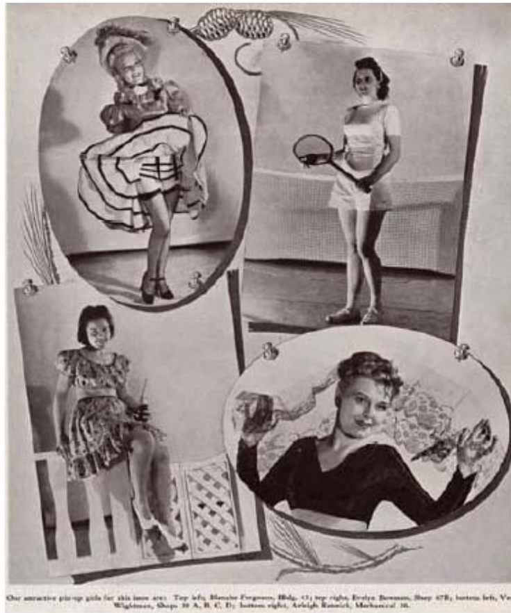
GECO Fusilier: A Powder Magazine Vol. 3 No. 2: May 8, 1944 General Engineering Company (Canada) Fonds Reference Code: F 2082-1-1-22, Box 3 Archives of Ontario