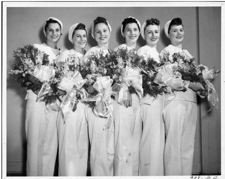
GECO beauty contestants