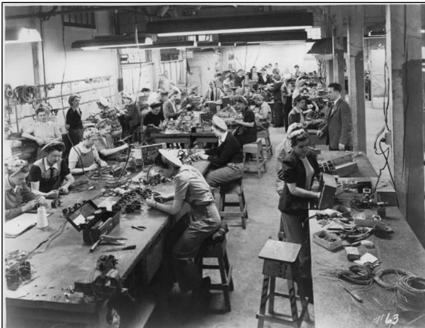
Women soldering and assembling cables for airplanes, Canadian Car and Foundry Co. 1945, Fort William (Ont.).