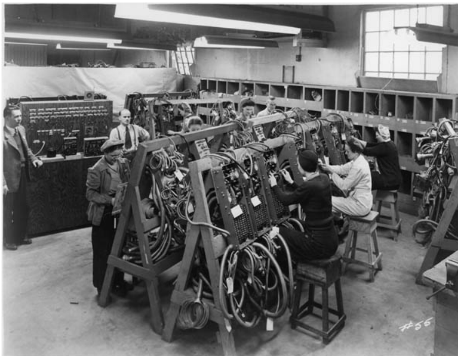
Women wiring the main distribution panels for airplanes, Canadian Car and Foundry Co. 1945, Fort William (Ont.)