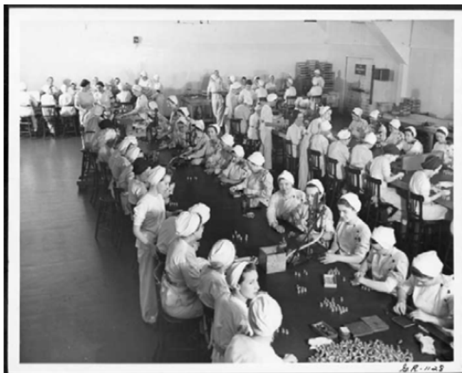
Filling Assembly, Primer 15 General Engineering Company (Canada) Fonds Reference Code F 2082-1-2-2.3 Archives of Ontario