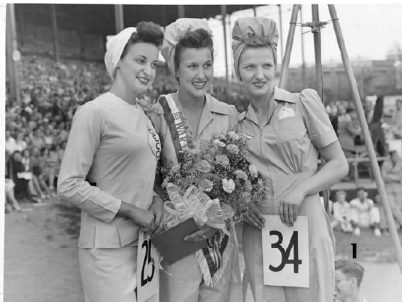
GECO beauty contest winners